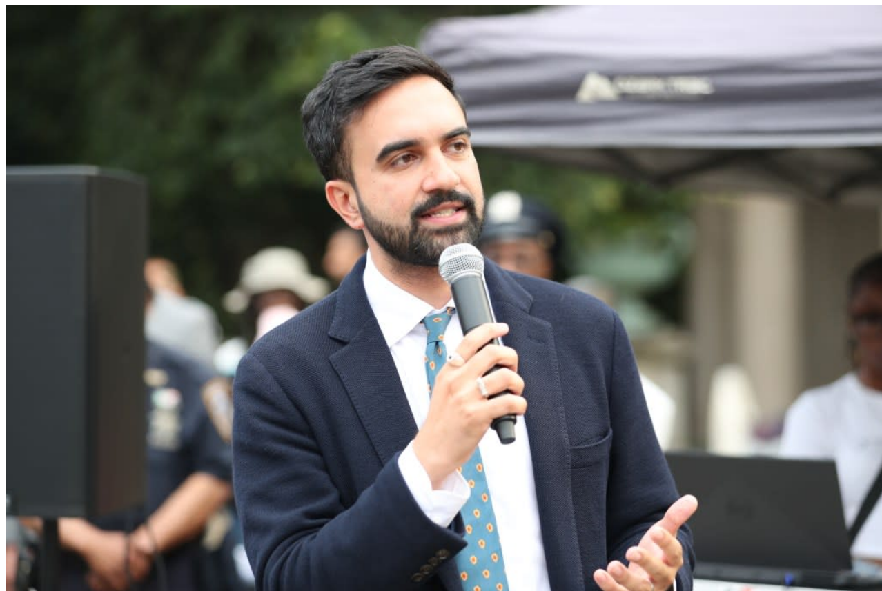
Socialist NYC mayoral candidate Zohran Mamdani held a private meeting with NY Archbishop Timothy Dolan on Tuesday.